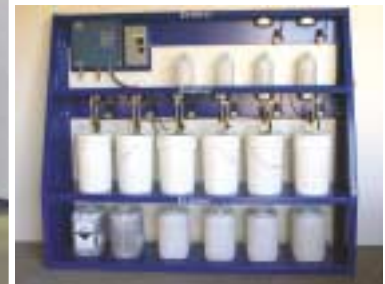
The Eurovac Central Chemical Dispensing System enhances the image of any Auto Detailing operation