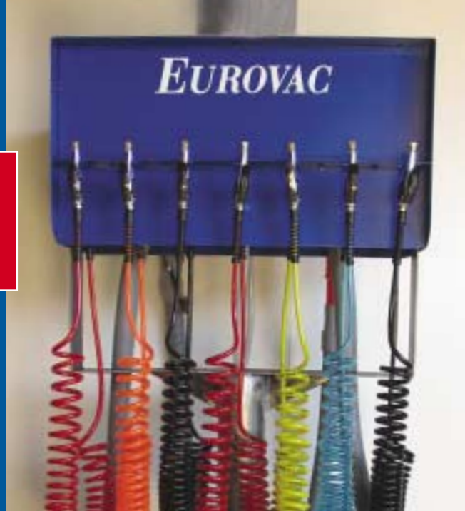
Supply Side of Eurovac Chemical Dispensing System