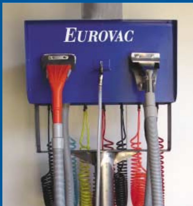
Vacuum Side of Eurovac Chemical Dispensing System