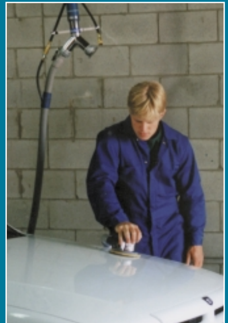
Body Shop Technician sanding car with orbital sander.