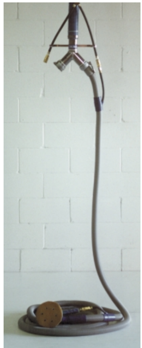
Double Workstation with co-axial hose and orbital sander.

HOSES 1" or 1½" vacuum hoses with integrated air line hoses do not feel very different than just one hose. We try to keep the hose as small as possible to reduce the drag on the hose. We also use swivel cuffs to eliminate the hose "fighting" the tool. 1½" hoses are generally used for vacuuming — larger hoses increase the rate of pick up.