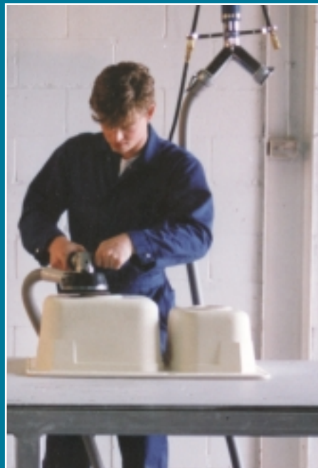
Factory Technician sanding fiberglass component with rotary sander.